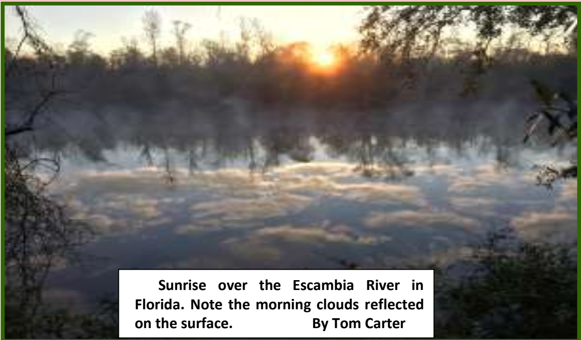
Sunrise over the Escambia River in Florida. Note the morning clouds reflected on the surface.

The Geritol Olympics were a huge success. They began Friday night with the Parade of Flags and ceremony. The games began Saturday morning. Everyone enjoyed games, such as the discus throw (paper plates), putt putt golf (cane as a putter), balance beam (taped on the floor), ring toss (bean bags into Olympic rings drawn on floor), curling (blowing a milk jug lid on the table top into a two inch square), blowing paper off a straw, and a timed event consisting of rolling dice, breaking balloon with darts, dropping clothespins into a jar, and carrying a plastic egg on a spoon around the room without dropping it. That night we awarded the Medals.